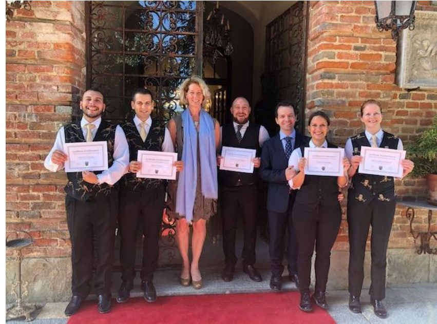
Photo taken on Polo & Tweed Training with Castello di Casalborgone, Italy

With limited time, our clients come to us for a full range of training services, from off the shelf training through to fully bespoke packages created around the specific property needs.